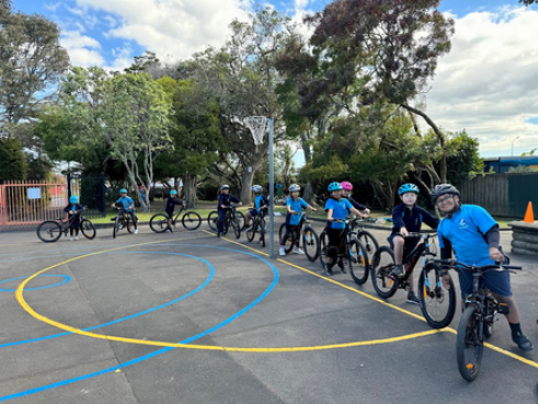
Year 5 and 6 children enjoying bikes in schools.